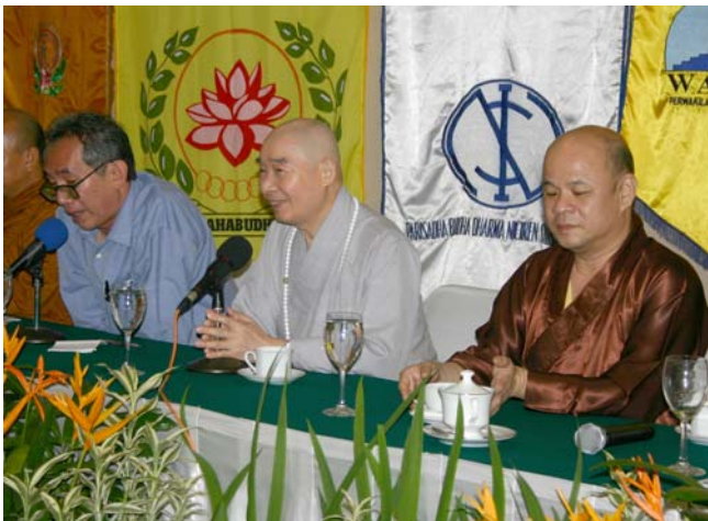
Visiting Islamic Headquarter, Majelis Ulama Indonesia, (MUI).