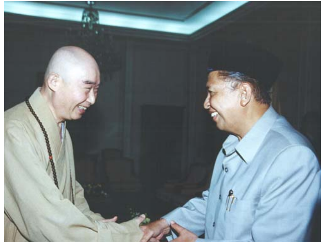
Dr. Hamzah Haz, Vice President of Indonesia

I have been propagating the teachings of Buddha Dharma for 46 years. For the past two decades, with the help of many civic supporters, I have circulated numerous lectures on sutras recorded on cas-