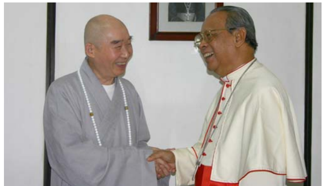
Visiting Christian Churches Conglomerate of Indonesia, Persekutuan Gereja-Gereja Di Indonesia (PGI)